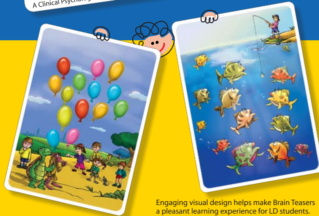
Engaging visual design helps make Brain Teasers a pleasant learning experience for LD students.